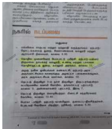
Hindu Tamil -24.01.2023